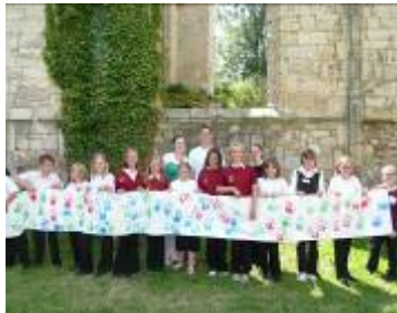
Celebrating Who We Are at Howden Minster

tions will be coming out soon! RE resource materials will sent to participating schools by Easter 2010 & briefings will be in May.