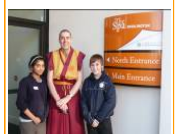
faith - to - faith

Through interactive workshops including soothing sounds from the Gamelan orchestra, calming meditation, lively Bollywood dancing, disciplined Islamic calligraphy, P4C, games, singing and drama, students challenged and explored faith & belief.