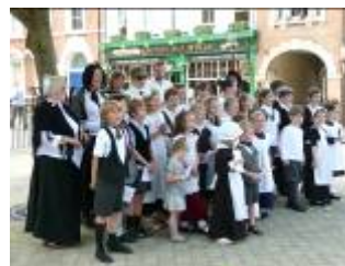
A Victorian class from Hull St Nicholas perform music hall songs in Trinity Square

The culmination of the pilot project was a Hands-On History family day at Holy Trinity Church in Hull. Hundreds of members of the public came to research Who Do You Think You Are? There was opportunity to search the parish records and climb the church tower. Horse-drawn carriage rides and Victorian costumes helped to set the scene. Some WDWTWA schools displayed and performed their work.