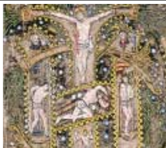
Detail from the Book of Kells, Trinity College, Dublin

and help themselves to whatever they would like to take... yes, really! Try it!