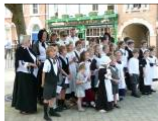
A Victorian class from Hull St Nicholas perform music hall songs in Trinity Square

The culmination of the pilot project was a Hands-On History family day at Holy Trinity Church in Hull. Hundreds of members of the public came to research Who Do You Think You Are? There was opportunity to search the parish records and climb the church tower. Horse-drawn carriage rides and Victorian costumes helped to set the scene. Some WDWTWA schools displayed and performed their work.